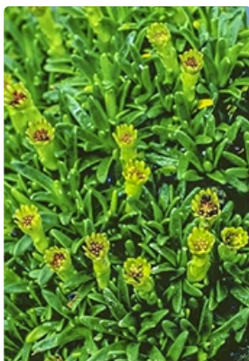
Carpet. Australian Plant Image Index, photographer Colin Totterdell, Kosciuszko National Park