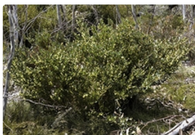
Shrub. Photographer Neil Blair, Mt Buffalo, © 2021 Royal Botanic Gardens Victoria Board