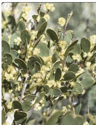
Flowering stems. Guthega