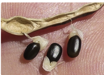
Open pod and seeds. Photographer Neil Blair, Mt Buffalo, © 2021 Royal Botanic Gardens Victoria Board