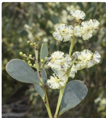
Flowering branches. Photographer Neil Blair, Mt Buffalo, © 2021 Royal Botanic Gardens Victoria Board