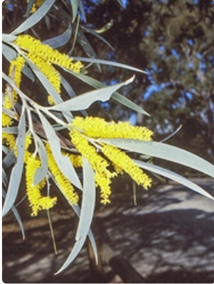
Flowering stem. Princes Highway inland from Jervis Bay.