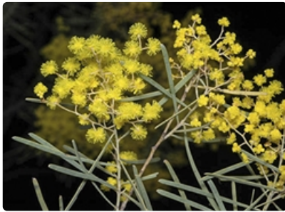
Flowering stems.