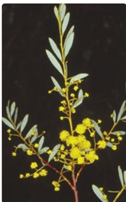
Flowering stems. Photographer Don Wood, Black Mountain, ACT