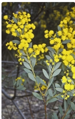
Flowering stems. Kings Highway near Batemans Bay