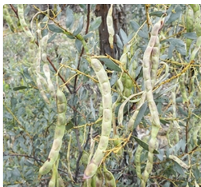
Pods. Photographer Neil Nair, Mt Plot, Vic. © 2021 Royal Botanic Gardens Victoria Board