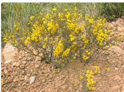
Shrub. Black Mountain, Canberra, ACT