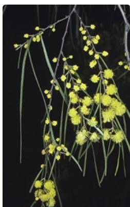
Flowering stems. Nadgee State Forest south of Eden.