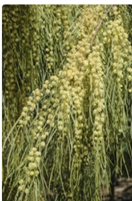
Flowering stems.