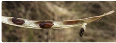
Open pod and seeds.