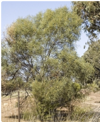
Shrub. Australian Plant Image Index, photographer Murray Fagg, Hawatha State Forest near West Wyalong