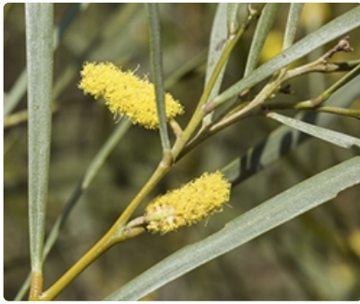
Flowering stem. Hawatha State Forest near West Wyalong