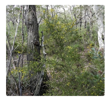
Shrub. Royal National Park south of Sydney