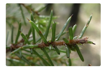
Leafy stem, Royal National Park, Sydney