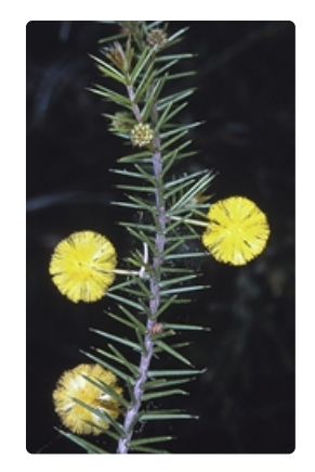
Flow ering stem. South Pacific Heathland Reserve, Ulladulla