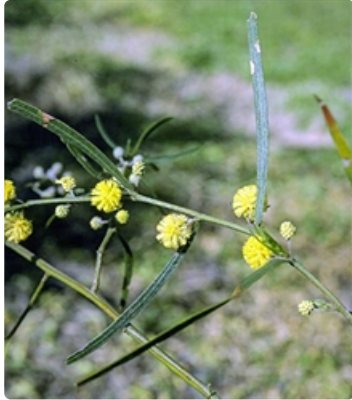
Flowering stem. Australian Plant Image Index, photographer Murray Fagg, Parry's Nursery, NSW