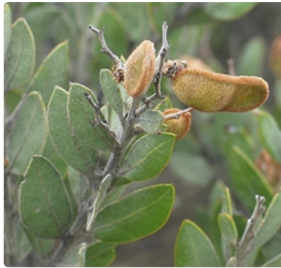
Pods and 'leaves'.