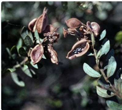
Open pods and 'leaves'.