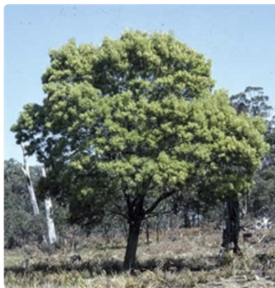
Tree. Australian Plant Image Index, photographer Murray Fagg, Mungarlowe, east of Braidwood