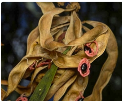
Pods and seeds showing the red arils.