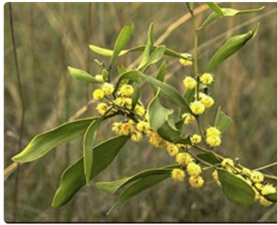
Flowering stems.