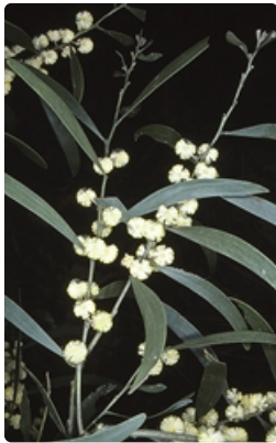
Flowering stem. Photographer Don Wood, near Sassafras, north east of Nerriga