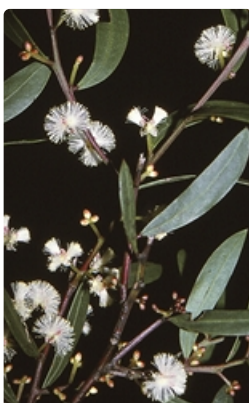
Flowering stem. near Huskisson