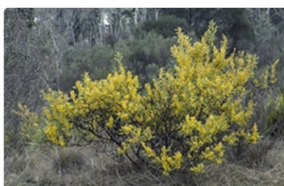
Shrub. Braidwood to Nerriga