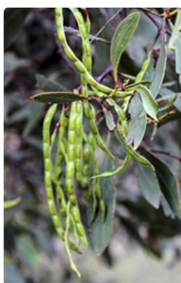
Pods and 'leaves'. Inglis Gorge, Vic