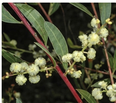
Flowering stems.