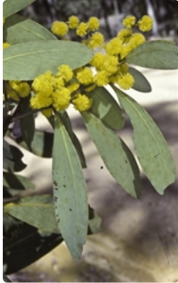
Flowering stem. Badja State Forest north east of Cooma