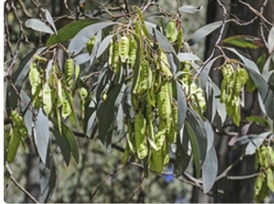
Pods and 'leaves'. near Mt Buller, Vic