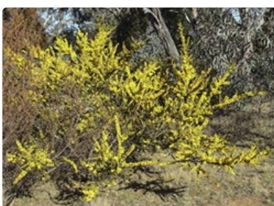
Shrub. Australian Plant Image Index, photographer Murray Fagg, Mount Ainslie, Canberra, ACT