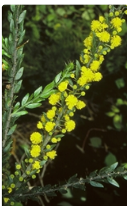
Flowering stem. Batehaven near Batemans Bay