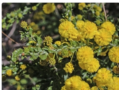
Flowering stem. Australian Plant Image Index, photographers RG & FJ Richardson, unknown site