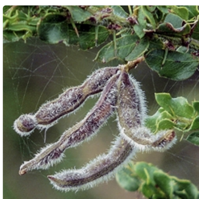
Pods and 'leaves'.