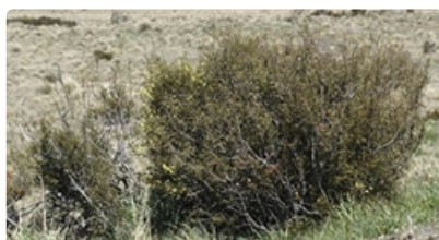
Shrub. near Kiandra