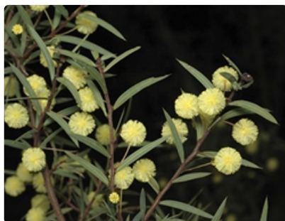
Flowering stems and 'leaves'.