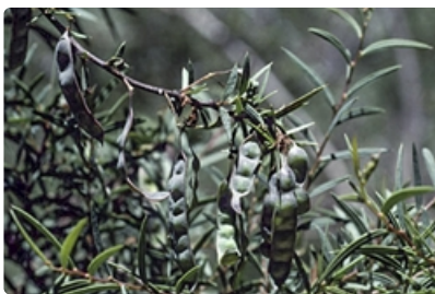
Pods and 'leaves'.