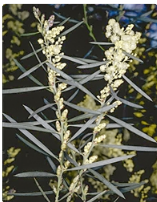
Flowering stems and 'leaves'.