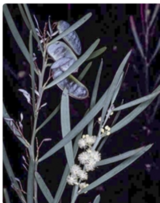
Flower heads, pods, and 'leaves'. near Forster