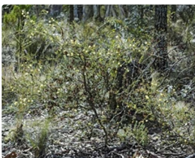
Shrub. Australian Plant Image Index, photographer Murray Fagg, near Numeralla east of Cooma