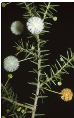
Flowering stem. Jervis Bay National Park, NSW