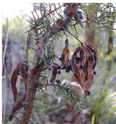
Pods and 'leaves'. Paruna Reserve, Comb, near Sydney