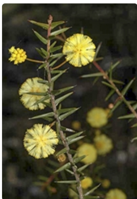
Flowering stem. near Numeralla east of Cooma