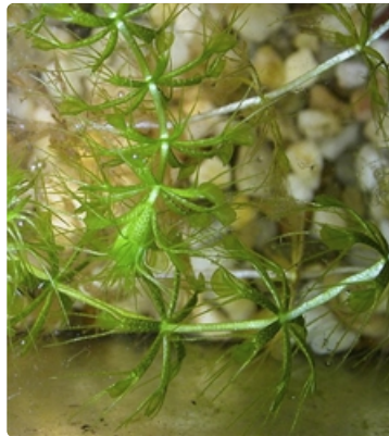
Leaves. unknown place