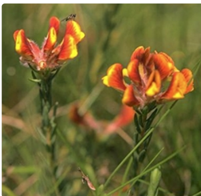
Flowers and leaves. Nunniong Plateau, Vic