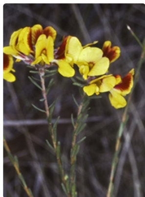
Flowers and leaves. Glenbog State Forest near Brown Mountain