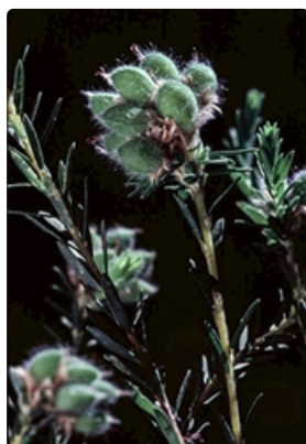
Leafy stems with pods.