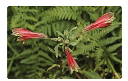
Top of flowering stem. near Nowra