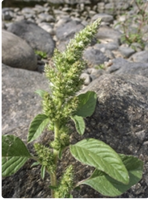
Flowering stem Australian Plant Image Index, photographer Murray Fagg, Murrumbidgee River, ACT