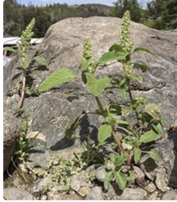
Plants. Murrumbidgee River, ACT