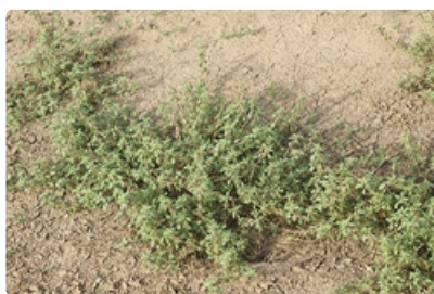
Plant. Kalyarr National Park north west of Hay