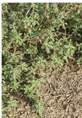
Plant. Kalyarr National Park north west of Hay