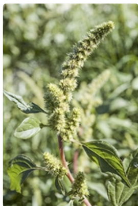
Flowering stem. Australian Plant Image Index, photographer Murray Fagg, Halliglo, ACT