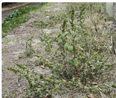
Plant.