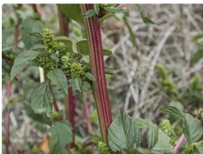
Stem