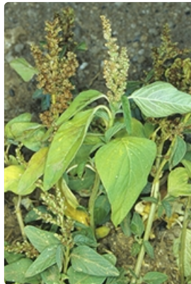
Plants. Photographer Don Wood, Carnarvon Station Bush Heritage Reserve via Augathella, Qld