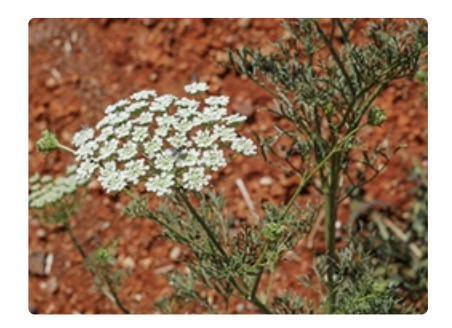
Flow er cluster and leaves.