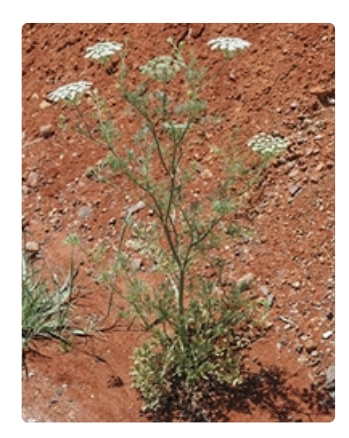
Rant. Australian Rant Image Index, photographer Murray Fagg, NSW