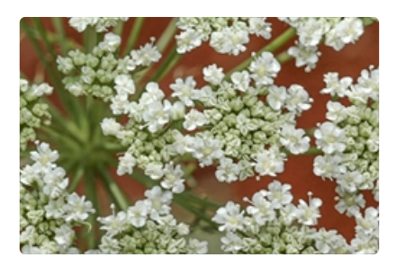
Flow er cluster closeup.