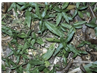
Leaves. Photographer Peter Woodard, Eastwood