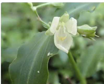
Flower and leaf. SW of Port Macquarie