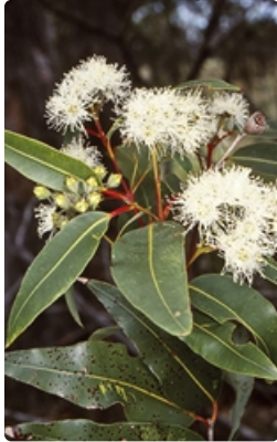
Flowers and leaves. north of Bermagui