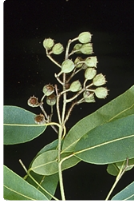
Gumnuts and leaves. Photographer Don Wood, Carnarvon Station Bush Heritage Reserve via Augathella, Qld