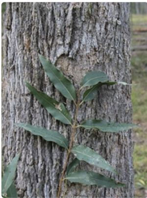
Trunk and juvenile foliage.