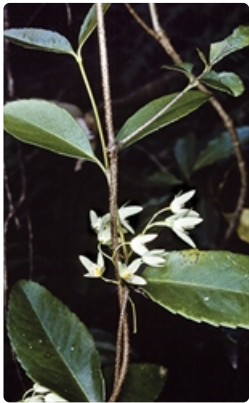
Flowering stem. Tathra Wildlife Reserve, near Tathra