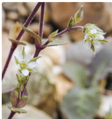
Flowering stems.