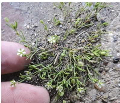
Flowering plant. Photographer Sam Kieschnick, Texas, USA