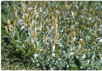
Flowering plants. Kosciuszko National Park