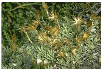
Seeding plants. Kosciuszko National Park