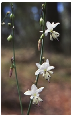
Flowering stem. Bungonia State Conservation Area east of Goulburn