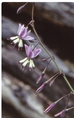
Flowering stem. Photographer Don Wood, Wadbilliga National Park