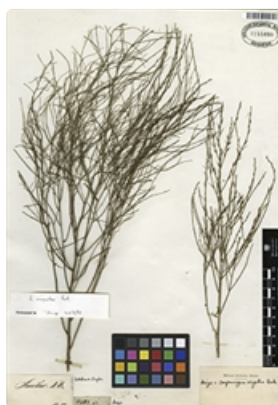
Dried specimen. Missouri Botanical Garden, USA