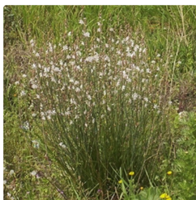
Flowering plant.