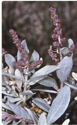
Stems with seed cases. Photographer Don Wood, Broulee beach