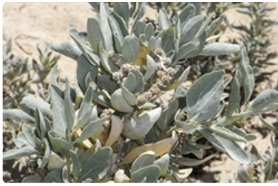
Flowering and seeding stems.