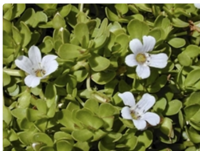
Flowers and leaves.