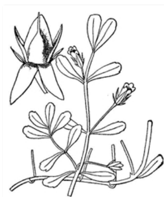
Line drawings. USDA-NRCS PLANTS Database Britton, N.L., and A. Brown. 1913. An illustrated flora of the northern United States, Canada and the British Possessions . Vol. 3: 192.