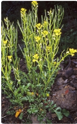
Flowering plant. Namadji National Park, ACT