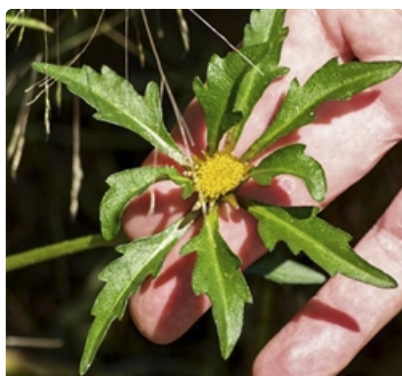
Flowering stem. near Sale, Vic