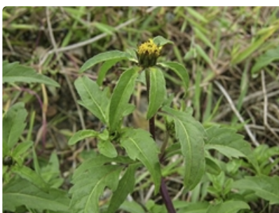
Flowering stem.