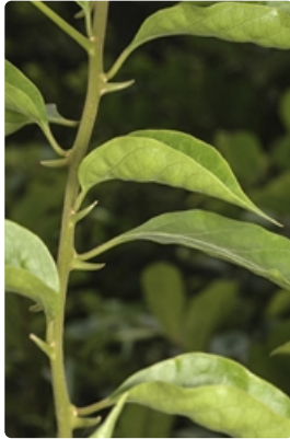
Leafy stem. east of Wisemans Ferry