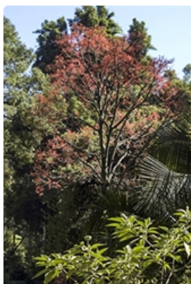
Tree. near Dorrigo