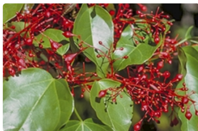
Flower buds, flowers, and leaves. Australian Plant Image Index, Australian Tropical Rainforest Plants Key