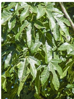
Leaves. Hawaii, USA