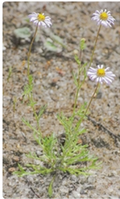
Flowering plant. Photographer Russell Best, Lake Albacutya, Vic