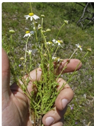
Flowering plant. Australian Plant Image Index, photographer Alexander Schmidt-Lebuhn, Illunie Nature Reserve south of Cowra