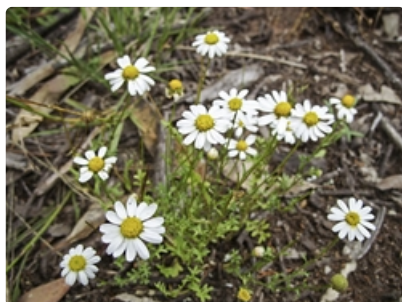
Flowering plant. Koorawatha Nature Reserve south of Cowra