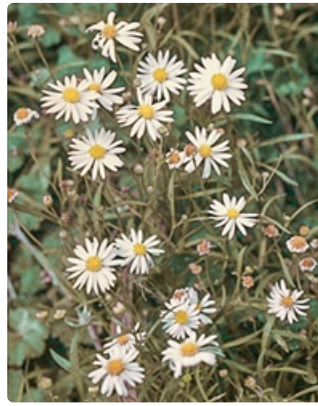
Flowering plants.