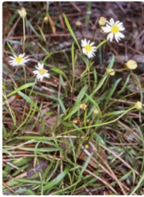
Flowering plant. Blackfellows Point east of Bodalla