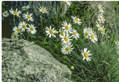
Flowering plants. Kosciuszko National Park