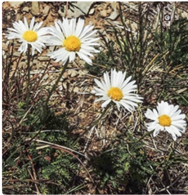
Flowering plants. Mt Hotham, Vic