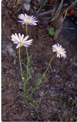
Flowering plant. Kowen Stock Route Reserve, ACT