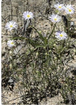
Flowering plants. Australian Plant Image Index, photographer Murray Fagg, Namadgi National Park, ACT