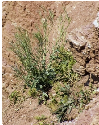
Fruiting plants.