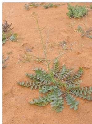
Plant. Scotia Sanctuary, western NSW