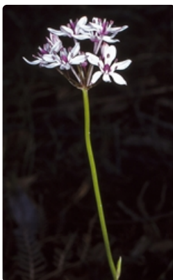
Flowering stem. north of Eden