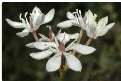
Flowers. Australian Plant Image Index, photographer Murray Fagg, Tidbinbilla Nature Reserve, ACT