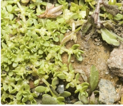
Flowering plant. Kosciuszko National Park