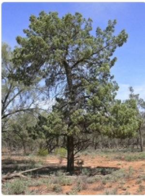
Tree. Scotia Sanctuary, western NSW