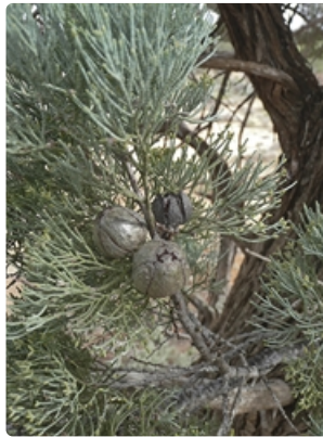
Cones and leaves. Scotia Sanctuary, western NSW