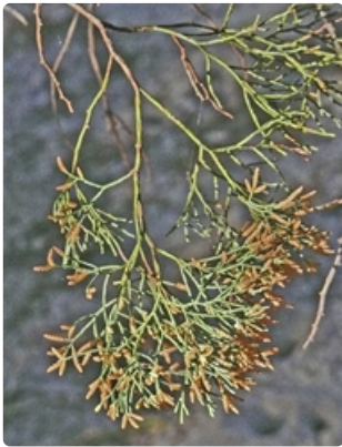
Stems with male cones. Photographer Don Wood, Carnarvon Station Bush Heritage Reserve via Augathella, Qld